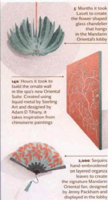
5 Months it took Lasvit to create the flower-shaped glass chandelier that hangs in the Mandarin Oriental's lobby

A revamped grande dame in London, a harbourside high in Hong Kong and an artistically minded guest house in Beirut